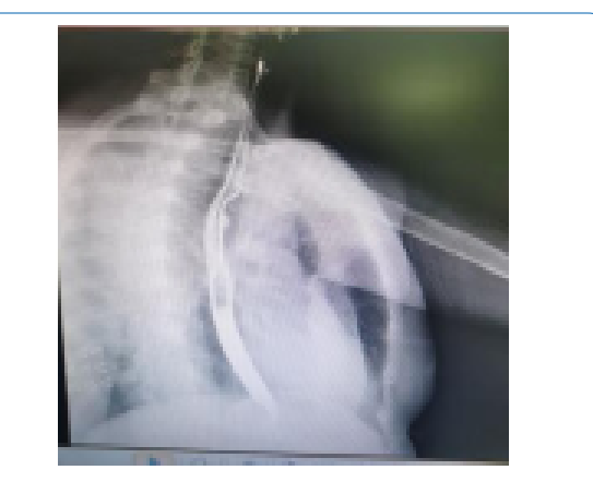
Figure 3: Esophageal diverticulum?.