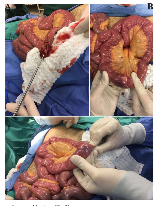
Figure 2: A jejunal mass (A) and an ulcerated lesion (B, C).

The bleeding rate was >100 ml/day or >0.07 ml/min based on transfusion requirements. As the surgeons refused to intervene without identifying the bleeding site and capsule endoscopy was unavailable, <sup>99m</sup>Tc-RBC scintigraphy was essential to localize the lesion. This low-cost, non-invasive method allows observing bleeding for 24 hours without suffering interference from oral or parenteral iron or transfusion.