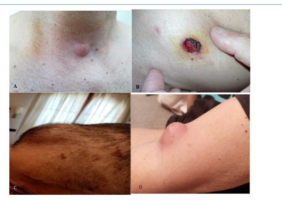
Figure 3: Diffuse nodular dermatosis (a), (d), with ulceration (b) and lytic lesion of the cranial theca (c).

We scheduled an esophagogastroduodenoscopy that was delayed for nearly a month due to the occurrence of an asymptomatic Covid-19 infection and that unfortunately revealed an infiltrating, bleeding, voluminous duodenal mass. The lesion was surgically removed and histopathological examination confirmed ALCL localization.