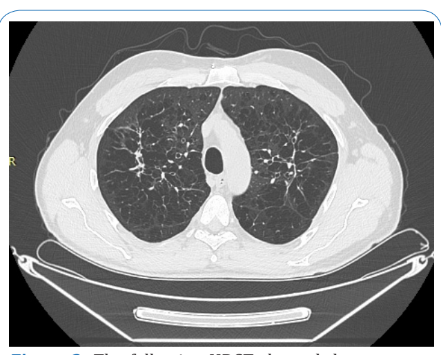
Figure 2: The following HRCT showed the presence in the posterior and anterior segments of the right and left upper lobe of panlobular and paraseptal emphysematous bullae, associated with pseudo-nodular areas in continuity with retracting fibrotic striae and traction bronchiolectasis.