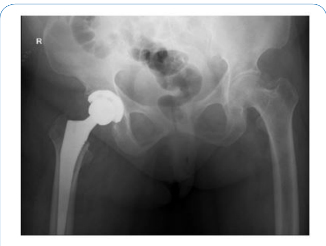
Figure 4: Case 1 hip replacement