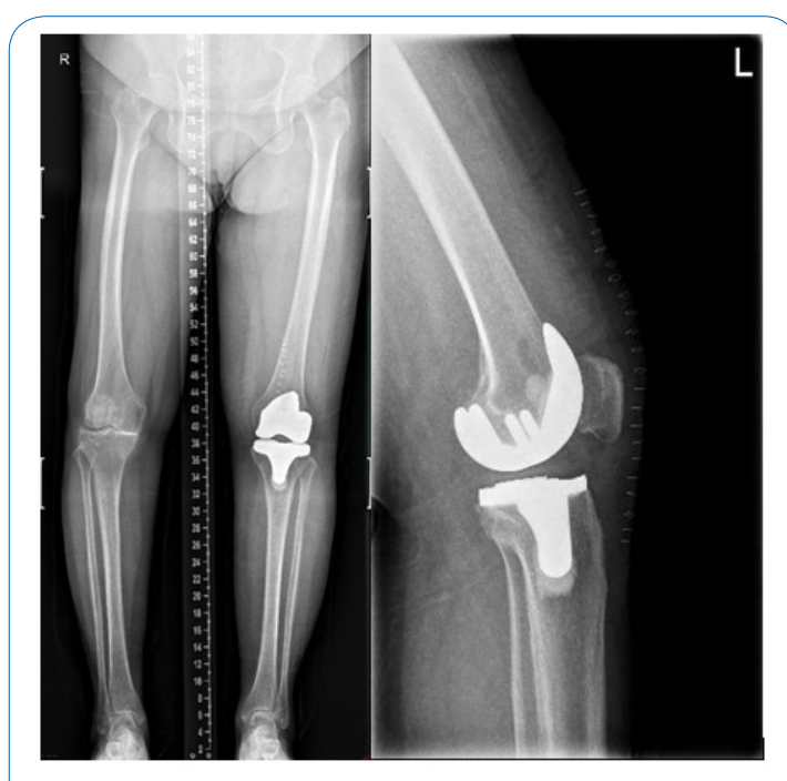
Figure 6: Case 2 after knee replacement