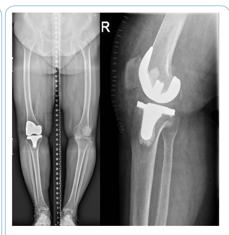
Figure 2: Case 1 after knee replacement

The patient came back again to the hospital 4 months following TKR, and complained of pain in her right hip for a month. Clinical examination and X-ray film: show the diagnosis of fracture of the right femoral neck, The patient denied any traumas (Figure 3).