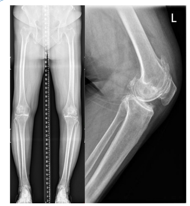
Figure 5: Case 2 prior to admission

FNS internal fixation was done for the fracture successfully. And she was permitted to sit in wheel-chair or stand on the unaffected leg within short period post-operatively (Figure 8).