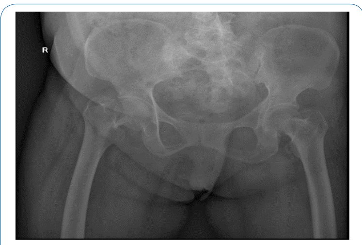
Figure 3: Case 1 fracture of the right femoral neck

Total hip replacement was performed for her and she was allowed to walked weight-bearing with the help of a walker, 1 week later she was discharged from the hospital (Figure 4).