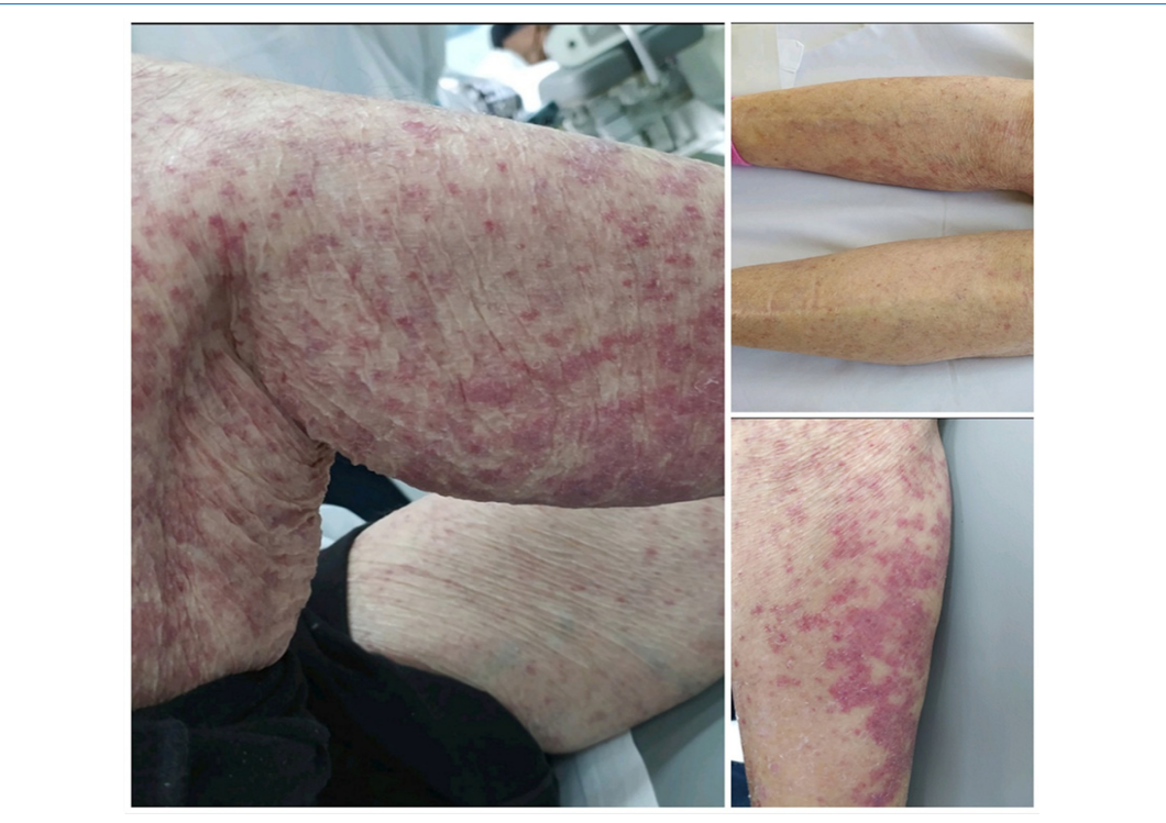
Figure 1: The palpable purpuric rash before (upper figure and bottom left) and after the treatment (bottom right).

There was inflammatory infiltrate in the wall of the dermal vessels with foci of fibrinoid necrosis and fragmented neutrophilic nuclei.