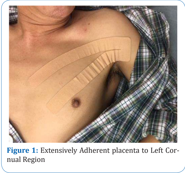
Figure 1: Extensively Adherent placenta to Left Cor-nual Region