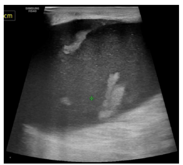
Figure 2: Longitudinal Ultrasound image, showing a well-defined collection, containing echoic debris.