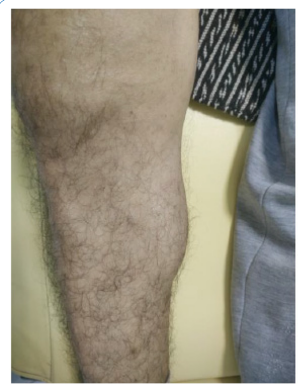
Figure 1: Photograph of the patient's legs showing asymmetry with increased volume on the posterior and medial calf of the right leg.

Because of the atypical appearance of the potential Baker cyst and the possibility of other diagnoses, a recommendation for a complementary (MRI) had been made, but because of lack of means, we did a ct scan, that found a fluid density, well-defined lesion, arising from the popliteal fossa and extending into the calf (Figure 3).