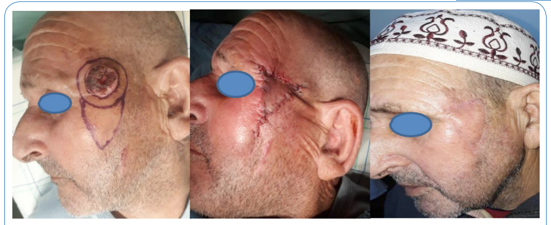
Figure 5: A) Ulcerative-bourgeous appearance of a tumor with hemorrhagic crusts and an erosive background in the temporofrontal region.