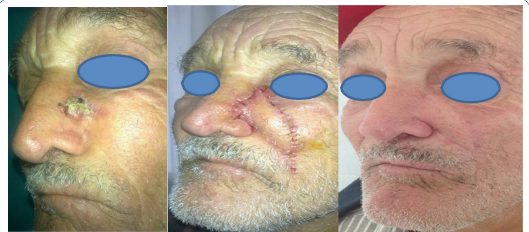
Figure 6: A) Ulcero-vegetative appearance of a tumor between the nasal and jugal area.B) Result after one week.C) Result after 3 months.