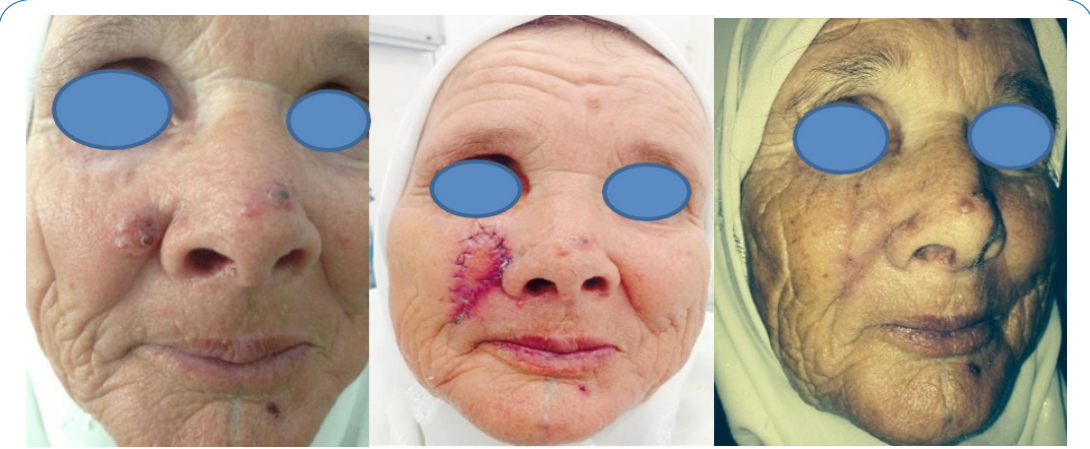
Figure 8: A) Nodular appearance of a tumor surrounded by an ovoid nest and surmounted by telangiectasias in the jugal region.B) Result after one week.C) Result after one month.