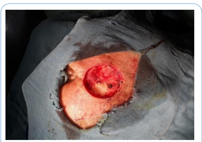
Figure 2: Excision of squamous cell carcinoma with careful hemostasis.