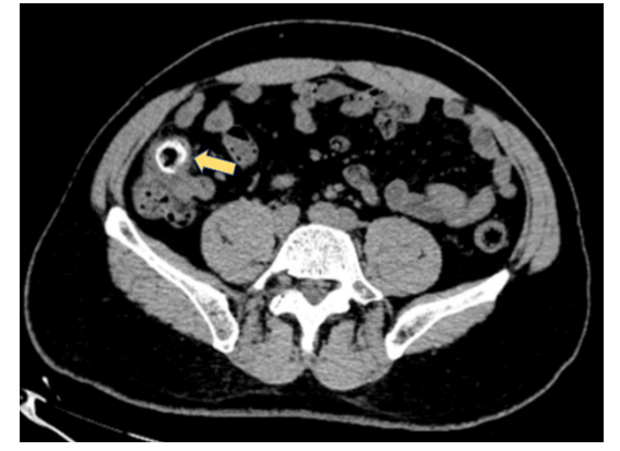
Figure 1: The computed tomography scan of abdomen showed about 20 mm X 20 mm circular high density shadow in right colon.

A 48-year-old male presented with mild right lower abdomen pain of 2 days duration, which was continue, without radiation. No accompanying symptoms such as fever, nausea, vomiting and diarrhea. His past medical history were hypertension and cholecystectomy. In addition, he has a history of constipation before cholecystectomy. He has no previous episodes of similar abdominal pain. Physical examination revealed abdominal tenderness in right lower quadrant. His blood routine and C-reaction protein examination were normal. During computed tomography scan of his abdomen (Figures 1,2) followed by colonoscopy, an unexpected finding was noted in caecum.