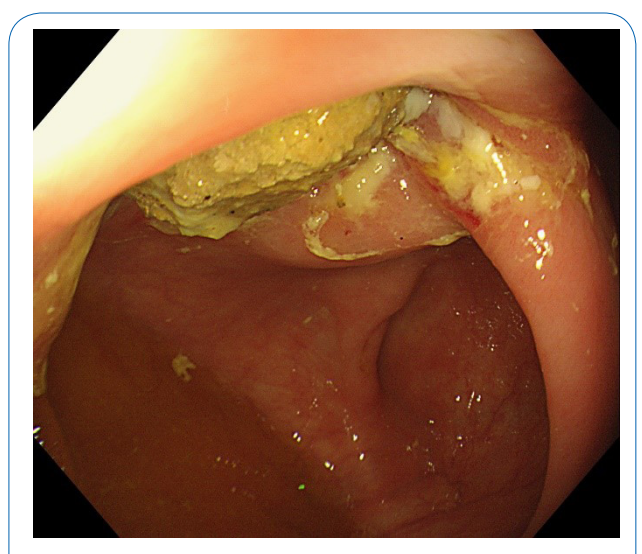
Figure 3: Colonoscopy showed the fecal impaction in the cecal diverticulum above the ileocecal valve.

removed successfully with a foreign forceps under colonoscopy. The internal mucosa of the diverticulum was hyperemia, and no perforation was observed (Figure 4). The patient's abdominal pain were relieved after endoscopic treatment. To prevent recurrence of the disease, surgical removal of the diverticulum was recommended but the patient was hesitant. There was no recurrence of abdominal pain and fecal impaction during 10 months follow-up.