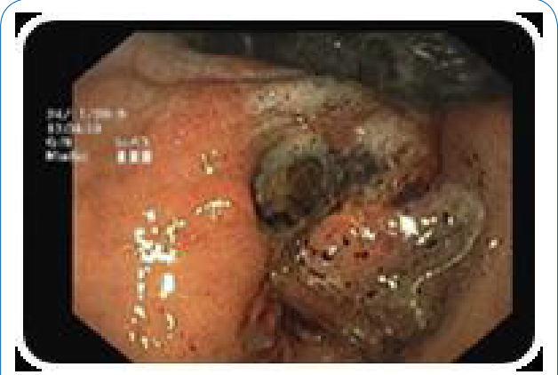
Figure 1: Endoscopic findings: ulcerating lesion in gastric antrum.