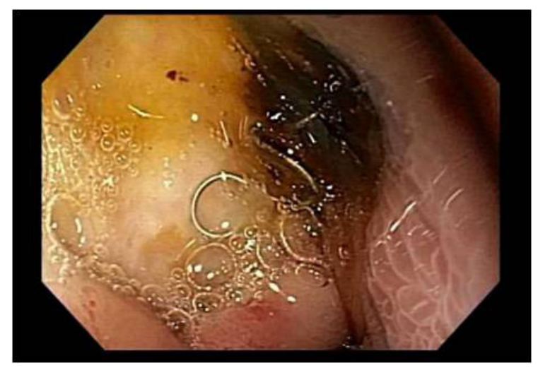
Figure 1A: Endoscopic image of a nonbleeding ulcer with visible embolization coils in the duodenal bulb.