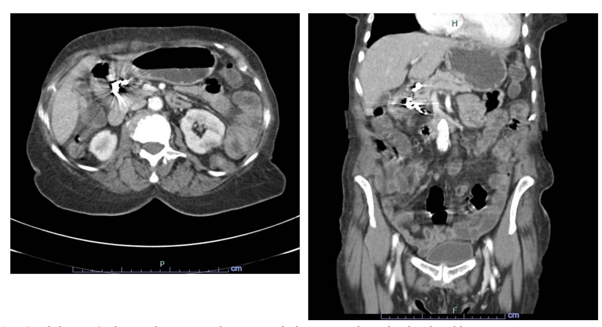
Figure 1B: CT abdomen/pelvis with contrast showing embolization coils in the duodenal lumen