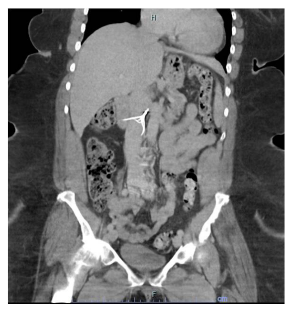
Figure 4: CT abdomen/pelvis with contrast showing a migrating IVC filter.