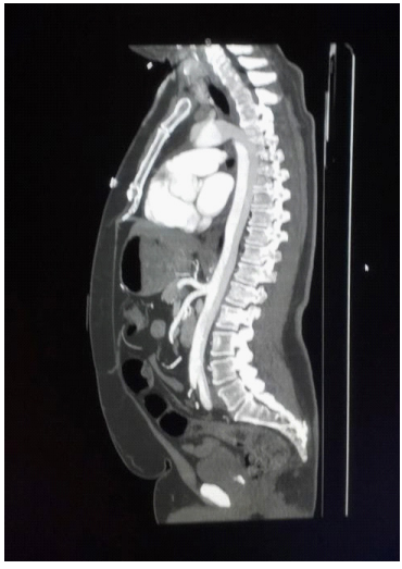
Figure 3: Thoraco-abdominal AngioTac: dissection from the aortic root to the left common iliac artery.