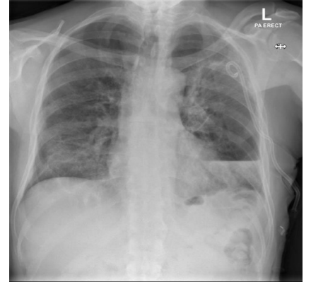
Figure 2: A chest radiograph on second presentation showing a left sided hydropneumothorax and an intercostal drain in situ.