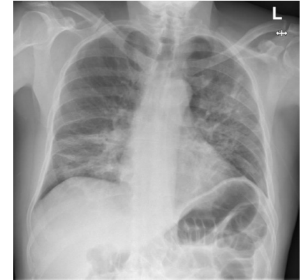
Figure 1: Chest radiograph on initial presentation showing significant bilateral mid- and lower-zone patchy consolidation classical for COVID-19.

The patient was discharged on a weaning regime of prednisolone and advice to restart azathioprine one week later. During follow-up the patient was asymptomatic with an improvement in exercise tolerance. However, two weeks later he had an episode of syncope and developed dyspnoea. He was tachypnoeic (respiratory rate 24/min) and tachycardic (heart rate 130/min). Bloods showed a significantly elevated d-dimer (13,763 ng/L) and a mildly elevated CRP (17 m/L) but were otherwise normal. A chest radiograph demonstrated a left lower zone loculated hydropneumothorax and persistent bilateral patchy consolidation consistent with known COVID-19 infection (Figure 2). A CT pulmonary angiogram demonstrated a right upper lobe pulmonary embolus, a left-sided loculated pneumothorax confined to the oblique fissure, pneumomediastinum and bilateral airspace opacification (Figure 3,4). The patient was treated with treatment dose low-molecular-weight heparin before being switched to a novel oral anticoagulant. A chest drain was inserted under CT guidance- a repeat CT scan showed resolution of the pneumomediastinum but persistence of the pneumothorax. As the appearance was loculated and stable, the patient's symptoms had resolved and he did not require oxygen, it was decided that further intervention was not indicated. He was discharged and a follow-up chest radiograph four weeks later showed resolution of the pneumothorax.