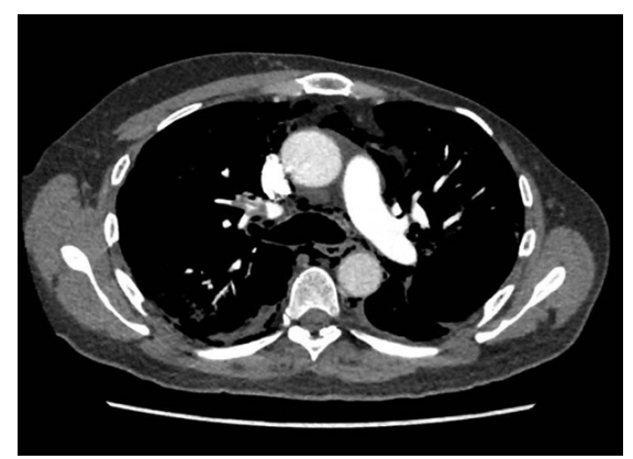
Figure 4: A CT pulmonary angiogram showing a right sided pulmonary embolism.