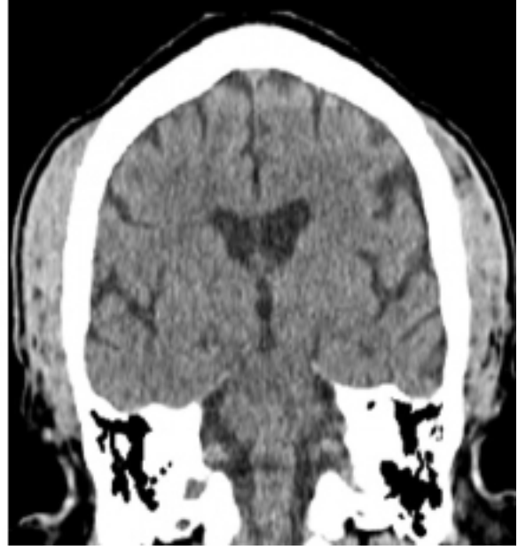
Figure 1: Computed Tomography of the head. (A) axial and (B) coronal planes reveal bilateral temporalis muscle hypertrophy (arrows).