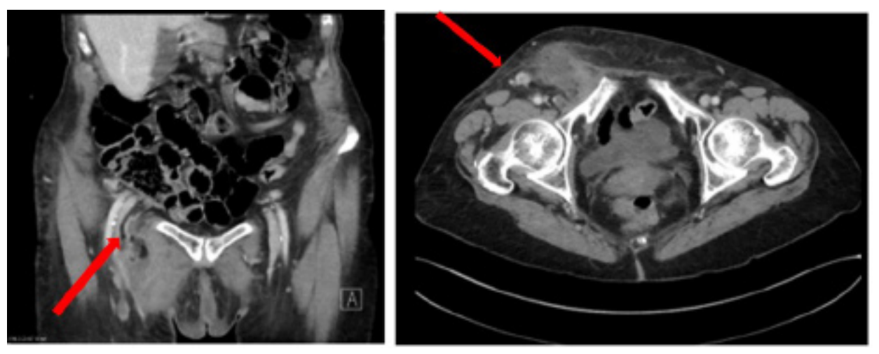
Figure 2: Abdominal CT scanner exposing the appendix in the hernia sac (red arrows).