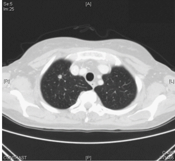
Figure 3: CT scan showing nodule in the right superior pulmonary lobe.