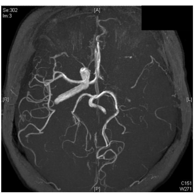
Figure 2: CT scan showing complete occlusion of the intracranial tract of the left internal carotid artery.