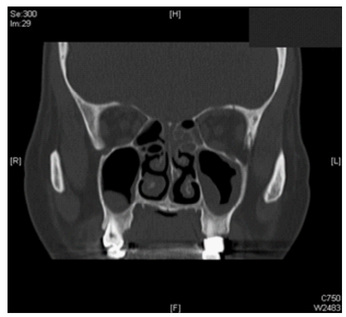
Figure 1: Diffuse opacification of paranasal sinuses as shown in the CT.

An empirical broad-spectrum antimicrobial therapy with Meropenem/Linezolid and Amphotericin B was started and few days later, the patient underwent surgical biopsy of the sphenoid sinus. The biopsy showed acute and chronic inflammation of the respiratory mucosa, periodic acid–Schiff and Grocott staining highlighted several broad septate fungal hyphae. Cultural analysis of pathological specimens revealed the presence of Scedosporium apiospermum (Figure 4, A & B).