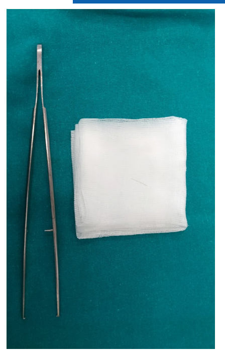
Figure 3: The extracted hair shaft.

Manuscript Information: Received: January 14, 2019; Accepted: February 25, 2020; Published: February 28, 2020