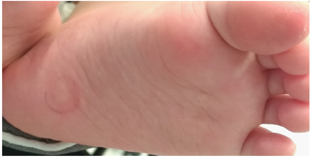
Figure 1: Clinical image of a circular black material on the left sole.

In this very rare condition, hair shaft penetrates the epidermis probably owing to friction, then moving while walking. Asian hair has been reported as having high tensile strength and a larger cross-sectional area compared to other ethnicities, explaining why most cases are reported in children from Asian countries. Cutaneous pili migrans has to be differentiated from larva migrans, in which lesions are serpiginous and very pruritic. Prompt recognition avoids potentially stressfull procedure like a biopsy.