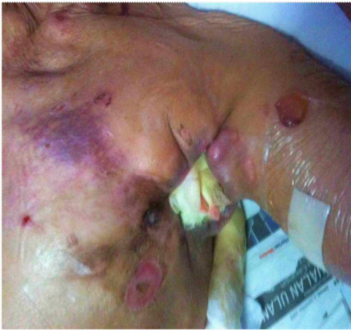
Figure 1: When represented with metastastic breast cancer after defaulting