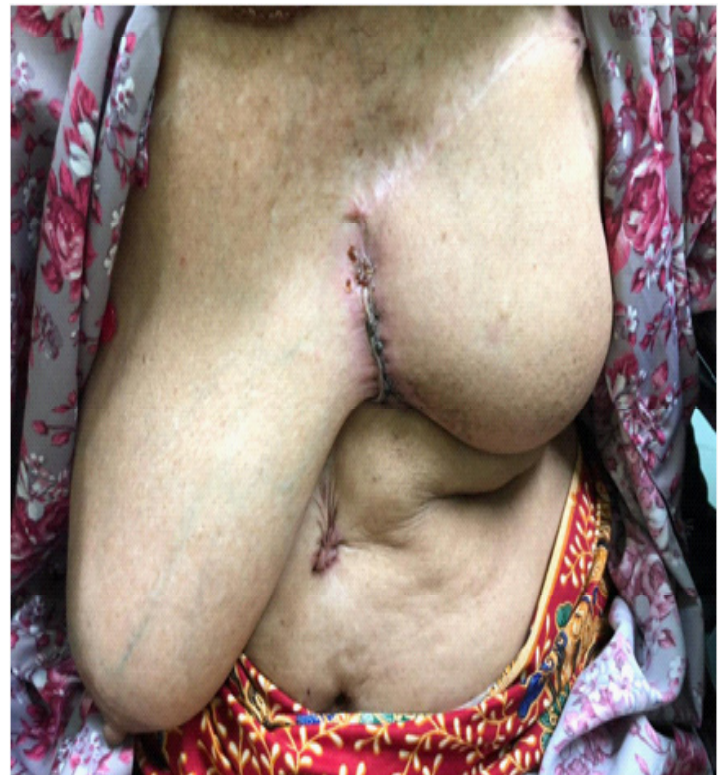
Figure 4: At present in her 9 years follow up