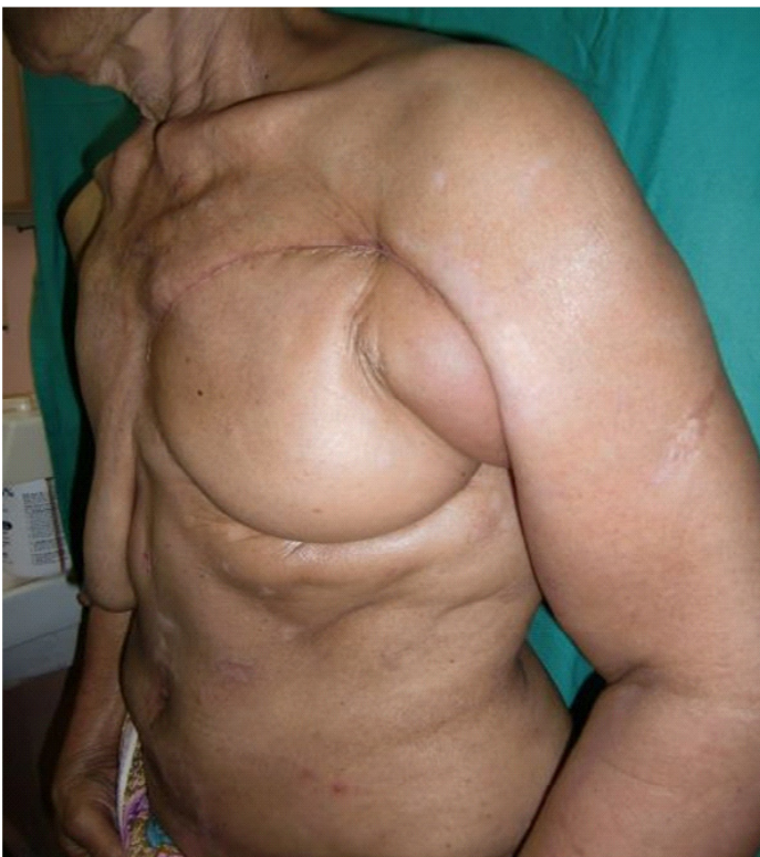
Figure 3: 4 months post procedure of mastectomy and tram