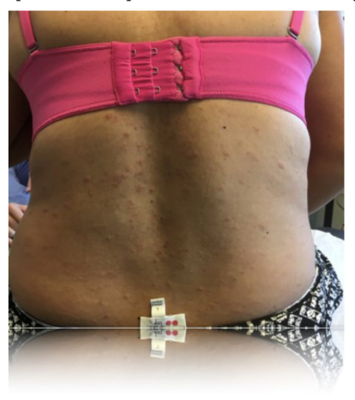
Figure 1: Scattered scaly erythematous papules and plaques on the lower back.