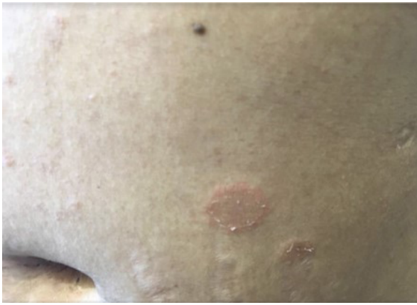
Figure 2: Close-up demonstrating circular erythematous plaques with trailing scale.