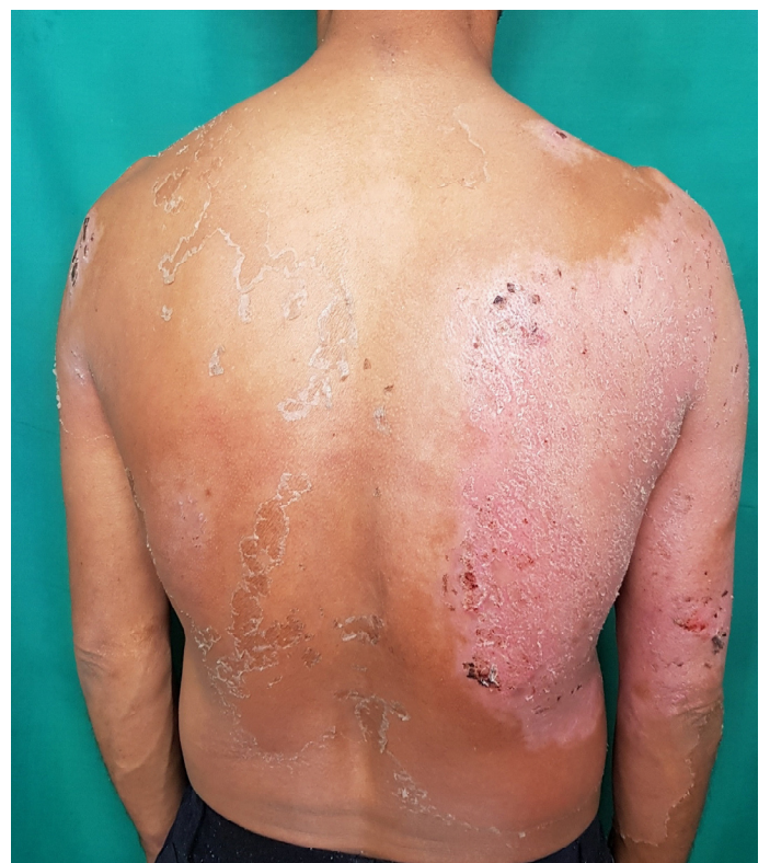
Figure 4: Lesions healing with rapid re-epithelialization after 10 days of antibiotic therapy.