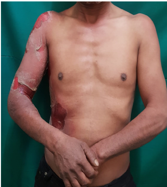
Figure 3: Anterior aspect of lesion over right forearm and arm and lateral aspect of trunk.