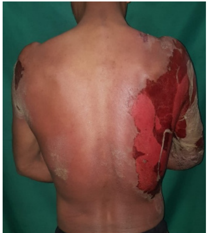
Figure 2: Salmon red colored erosions with peeling and desquamation of the superficial layers of skin over back (right side) and a smaller patch over left shoulder with relative sparing of central part of back.