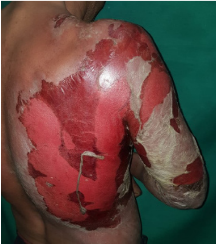
Figure 1: Salmon red colored erosions with peeling of superficial skin layer over the right arm and adjoining posterolateral trunk.