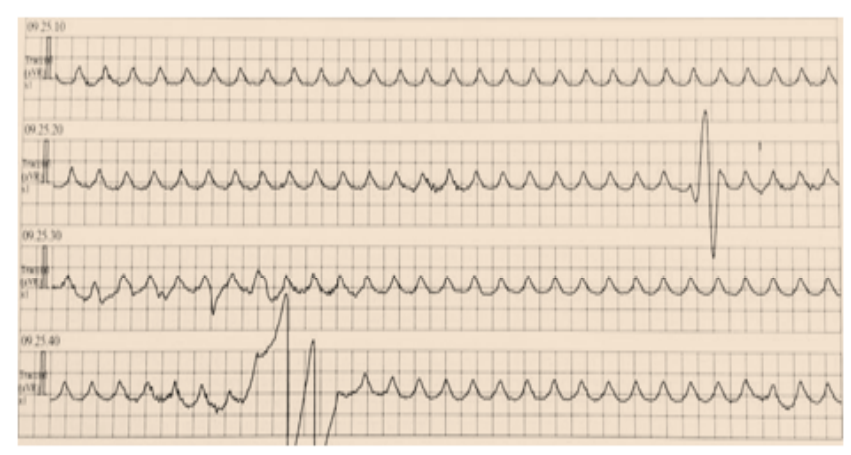
Figure 3: Sustained ventricular tachycardia