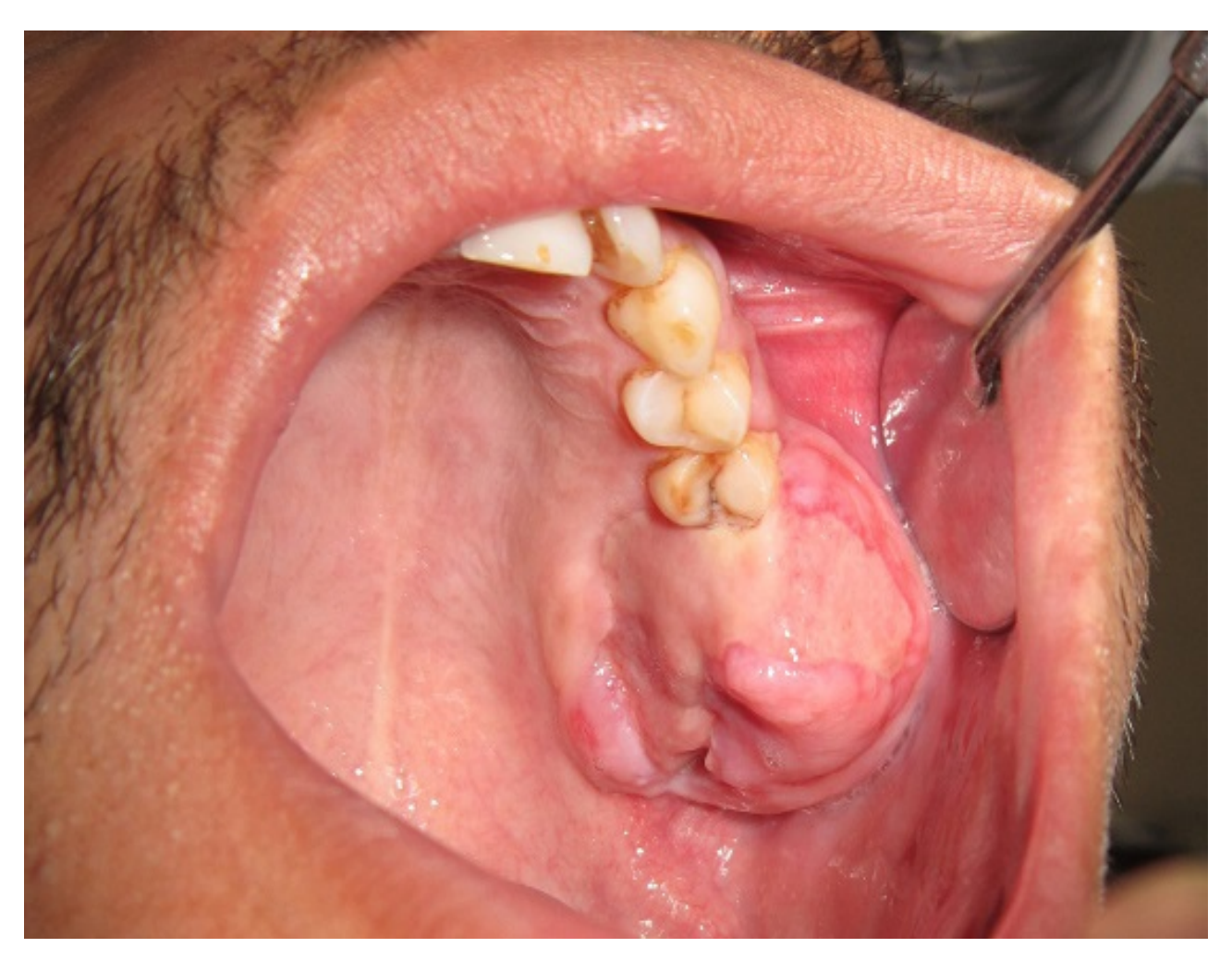
Figure 1: Clinical photograph showing a sessile, firm, soft tissue growth in maxillary left posterior region