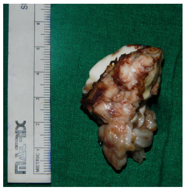
Figure 4: Gross specimen showing greyishwhite, oval mass with glistening mucoid appearance