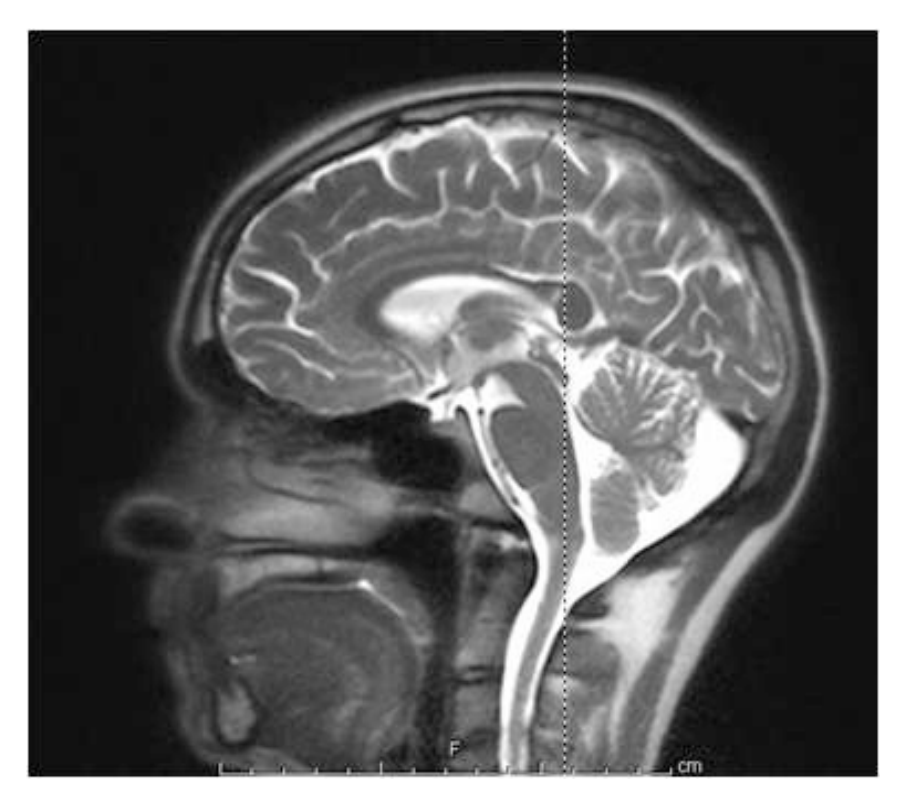
Figure 1: Saggital T1 Flair showing no abnormalities