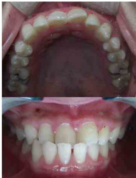
Figure 3a &amp; 3b