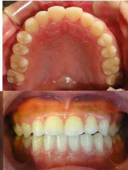
Figure 9a &amp; 9b